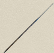
Roman Thin Pilum