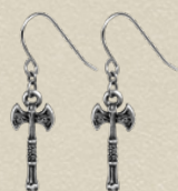
Viking Wolf Axe Earrings