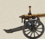
1861 Miniature Civil War Gatling Gun