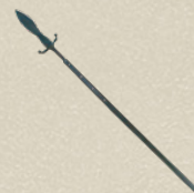
Authentic Celtic Spear