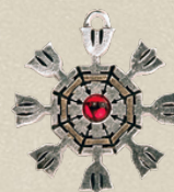
Eagershelm Viking Necklace