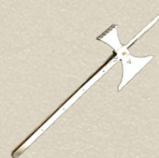
Pole Axe Head