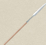
Long Bladed Hewing Spearhead